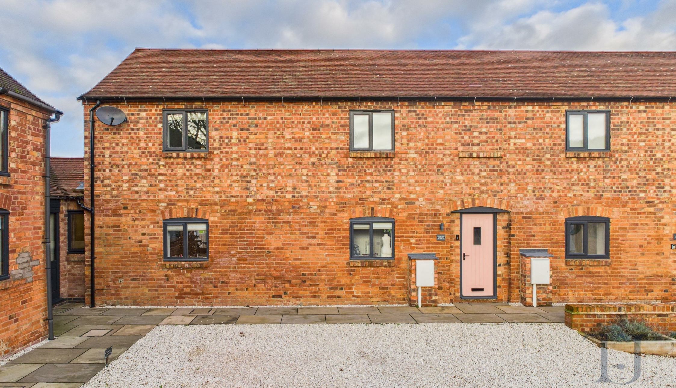
Cherry Tree Cottage, Bunny Hill, Bunny, NG11 6QQ